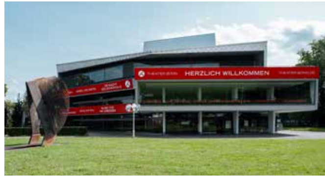
Opernhaus Am Boeselagerhof 1 | 53111 Bonn - Zentrum