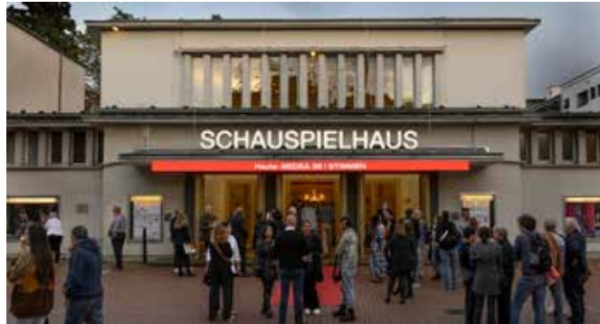
Schauspielhaus Theaterplatz | 53177 Bonn - Bad Godesberg